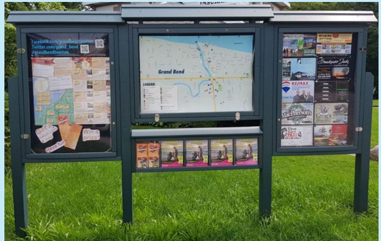
Advertising spots sold on a first-come-first-served basis.